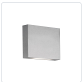
AT6606-BN Brushed Nickel